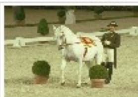
Lipizzan on the Long Rein The Spanish Riding School of Vienna

A Texas premiere will accent Super Ride VII: The 2009 United States Equestrian Drill Championship (USEDC).