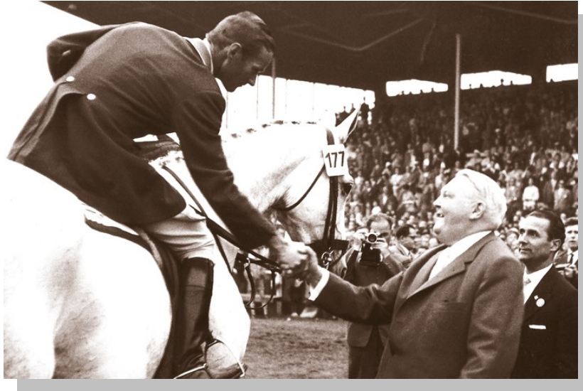
BILL STEINKRAUS (USA) AT CHIO AACHEN (1958)