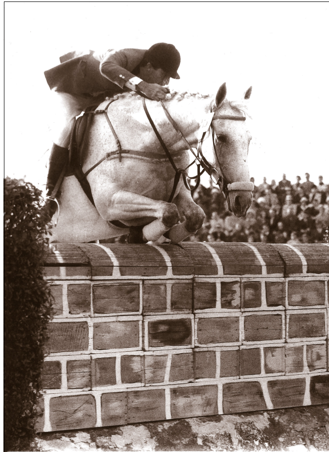
NELSON PESSOA (BRA) AND GRAN GESTE AT CHIO AACHEN (1964)

SOURCE: BLOOMBERG BUSINESS WEEK AND THE KHALEEJ TIMES